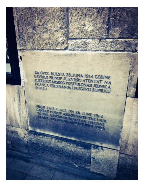
Sarajevo attack