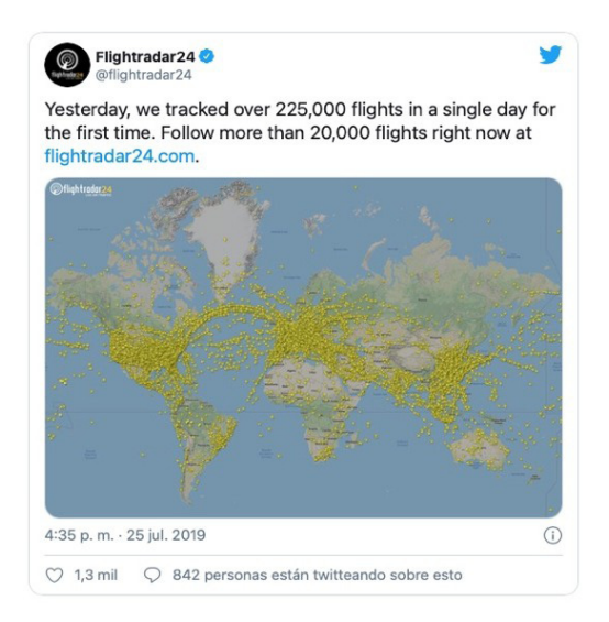
World air operations record before the COVID-19 pandemic.

The Wuhan coronavirus is particularly contagious and emerged at a time of great social connectivity on the planet owing to development and the Fourth Industrial Revolution. In the year before it appeared, in 2018, an average of almost 100,000 flights per day, involving the movement of 12 million people per day, were taking place around the world. On 24 July 2019, the record number of daily operations in the history of aviation was recorded at 225,000 flights, a figure that will probably not be surpassed for many years due to some of the reasons that are analysed in this paper.<sup>8</sup>