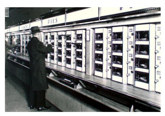
Automatic restaurant in the 20th century

the human eye. The digitisation of the company began with the mechanisation of processes in the 20th century. Technology was not used here, but automatic mechanical processes were used. The most famous example is Henry Ford's chain manufacturing. Other examples after the Second World War would be automatic restaurants, in which physical contact between staff and customer disappeared.